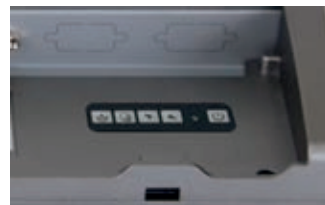
Easy Rear access to OSD