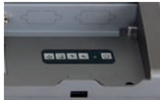
Easy Rear access to OSD