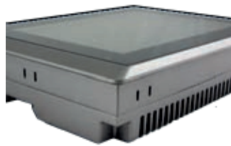
Zero bezel frontal panel