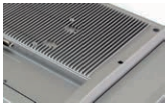
Die-casted aluminium rear