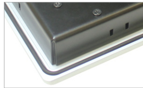
Zero bezel frontal panel