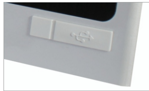
IP65 Front Panel