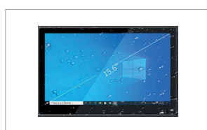
IP65 Front Panel