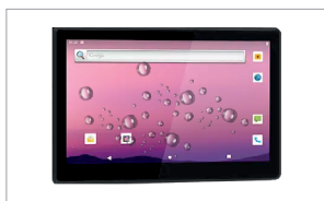
IP65 Front Panel