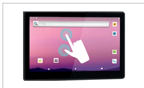
Projected Capacitive 10 point