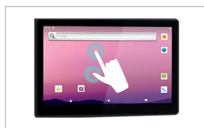
Projected Capacitive 10 point