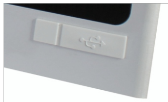
Ip65 Front Panel