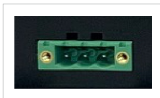
Wide range power input